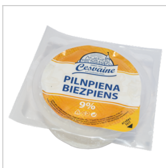
Cesvaine Whole Milk Curd Cheese 9%.

Product group Dairy products and eggs Product subgroup Fermented milk products, Curd Product code 0406 Product line