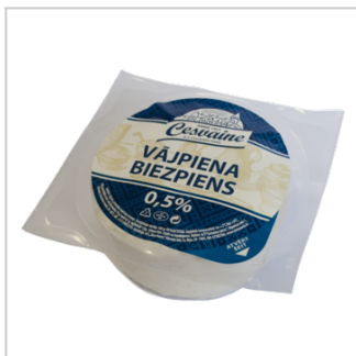
Cesvaine Skimmed Milk Curd Cheese 0.5%.

Product group Dairy products and eggs Product subgroup Fermented milk products, Curd Product code 0406 Product line